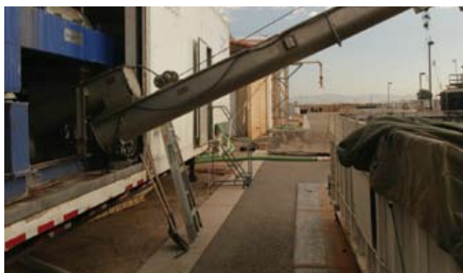
Power Plates are saving the plant money round the clock.