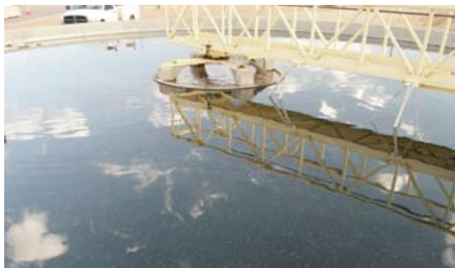
The plant's large decanter now draws 20% less power.

A wastewater treatment plant operating 24/7 is already realizing energy-saving benefits. They installed Power Plates on their NX 439 decanter processing 25 m 3 /hour. The decanter draws 10% less power from the main motor (down to 17.5 kWh from 20 kWh) and they are saving 25% on flow-dependent power. The plant now more efficiently serves its local community of 250,000 residents.