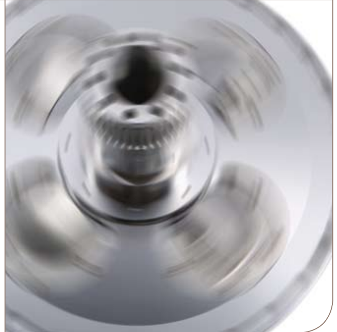
Power Plates can be installed quickly and easily.

An example of power consumption before and after installation of Power Plates.