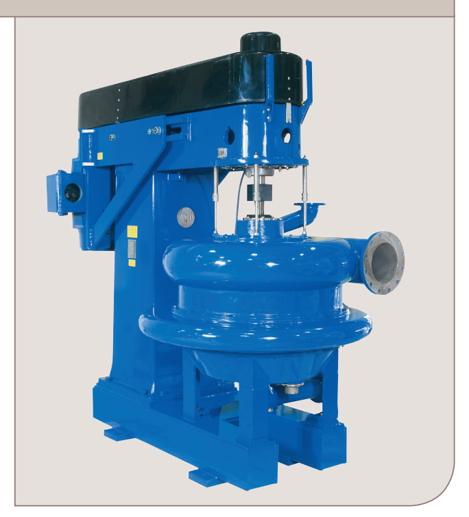
Merco CH-38 GOF with motor

The CH-38 employs a special recirculation system that provides highly efficient separation. Solids can be recirculated to the nozzles at the same time as wash water is being recirculated. Working with the underflow draw-off valve, the return flow system provides a unique means of controlling the separation process. It allows the operator to control and optimise the separation process – by determining how much underflow is to be removed, how much is to be recycled back to the rotor and how much wash water is to be added. This makes it possible to use nozzles with a large diameter, which act as buffers to even out variations in feed concentration and to prevent blockages. The machine thus becomes more versatile, and can be easily adapted to changes in procedure.